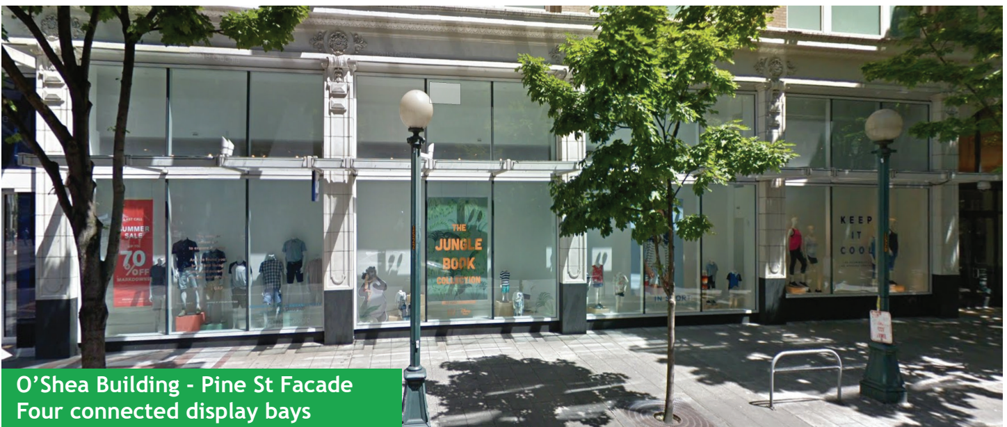
O'Shea Building - Pine St Facade Four connected display bays