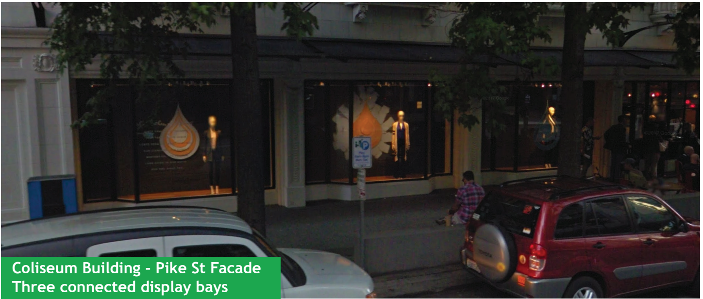
Coliseum Building - Pike St Facade Three connected display bays