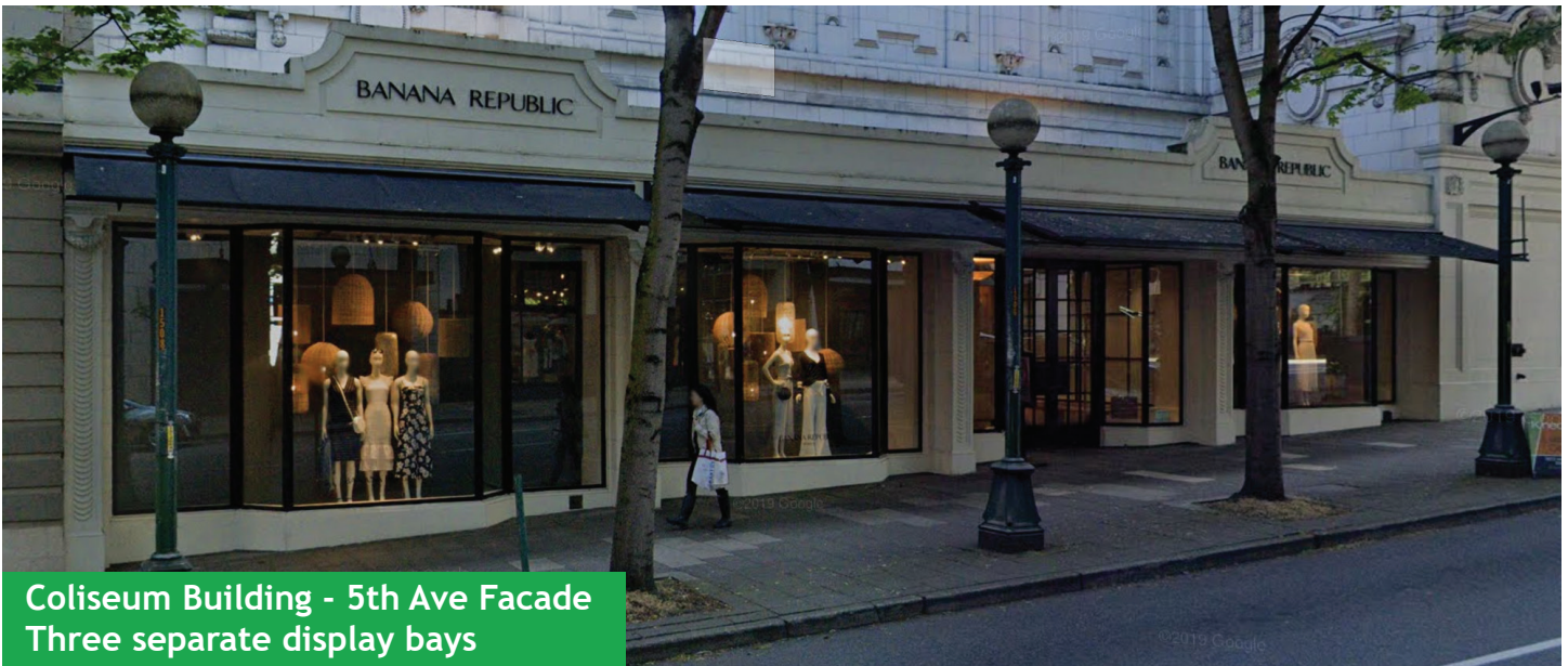
Coliseum Building - 5th Ave Facade Three separate display bays